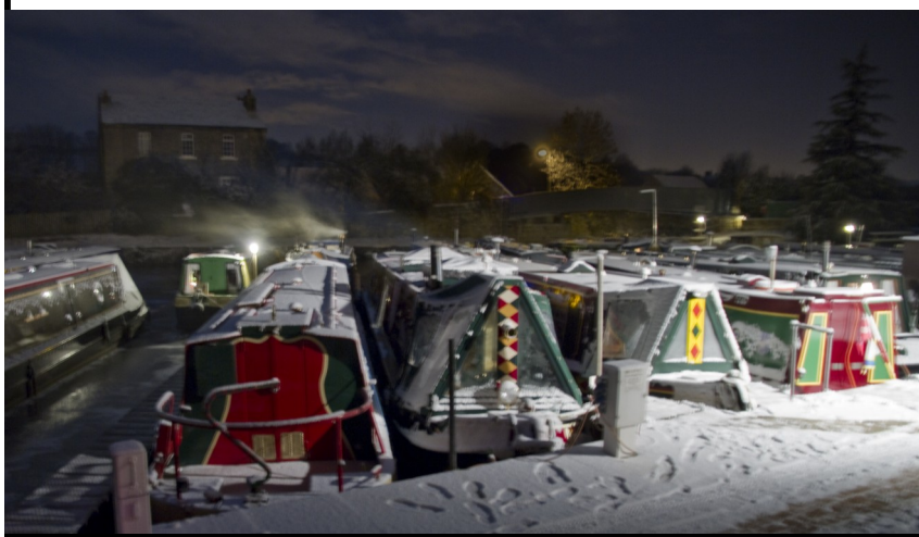
Christmas calm in the basin at South Pennine boat club