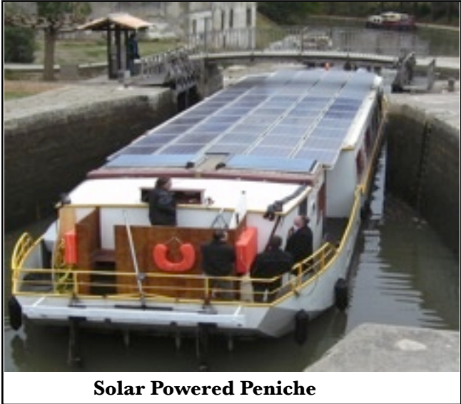
Solar Powered Peniche