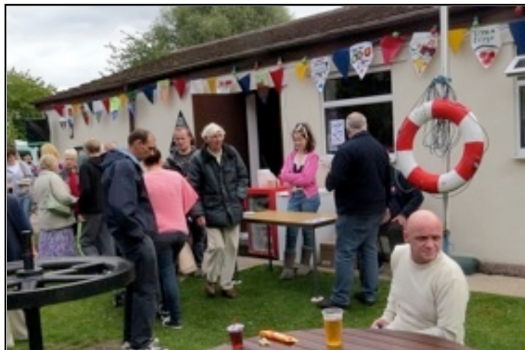
The children's bunting decorates the BMBC Club House. Visitors enjoy the days attractions as well as a pint!

The event was run in partnership with the local Halton Disability Partnership and they had got the local schools