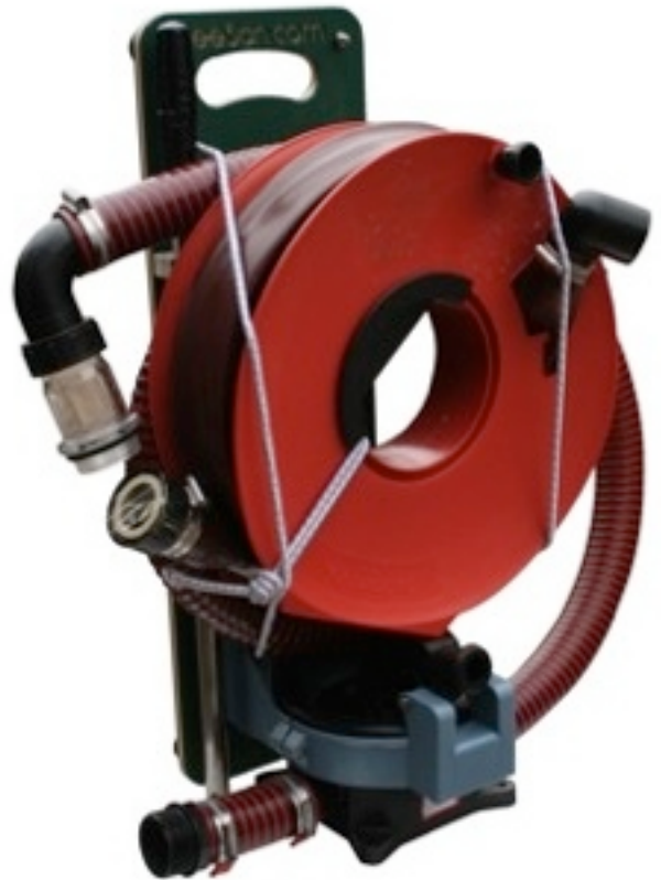
LeeSan SELF PUMP OUT UNIT

Lee Sanitation Ltd. Tel: 01295 770000 – Fax: 01295 770022