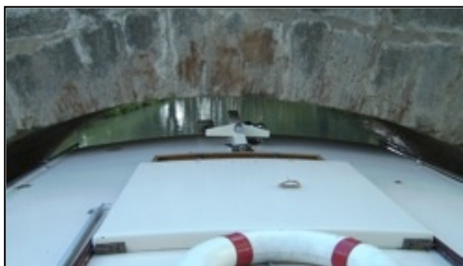
Bon Viveur is quite a tight fit in Capestang Bridge (not recommended in high winds)

Boated to Capestang where the lowest bridge on the Midi is