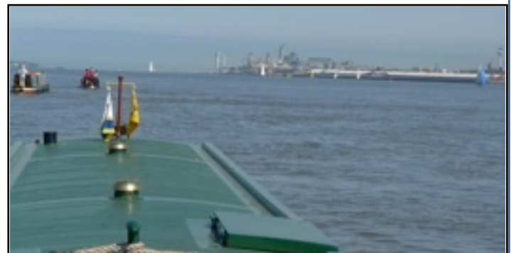
CROSSING THE MERSEY TO LIVERPOOL

Sunday morning dawned and by 8.30am we were ready and on our way. The weather couldn't be better. Down the lock we went to the Ship Canal level and waited in the basin for clearance. There was excited anticipation. Then at last we were off into the main line of